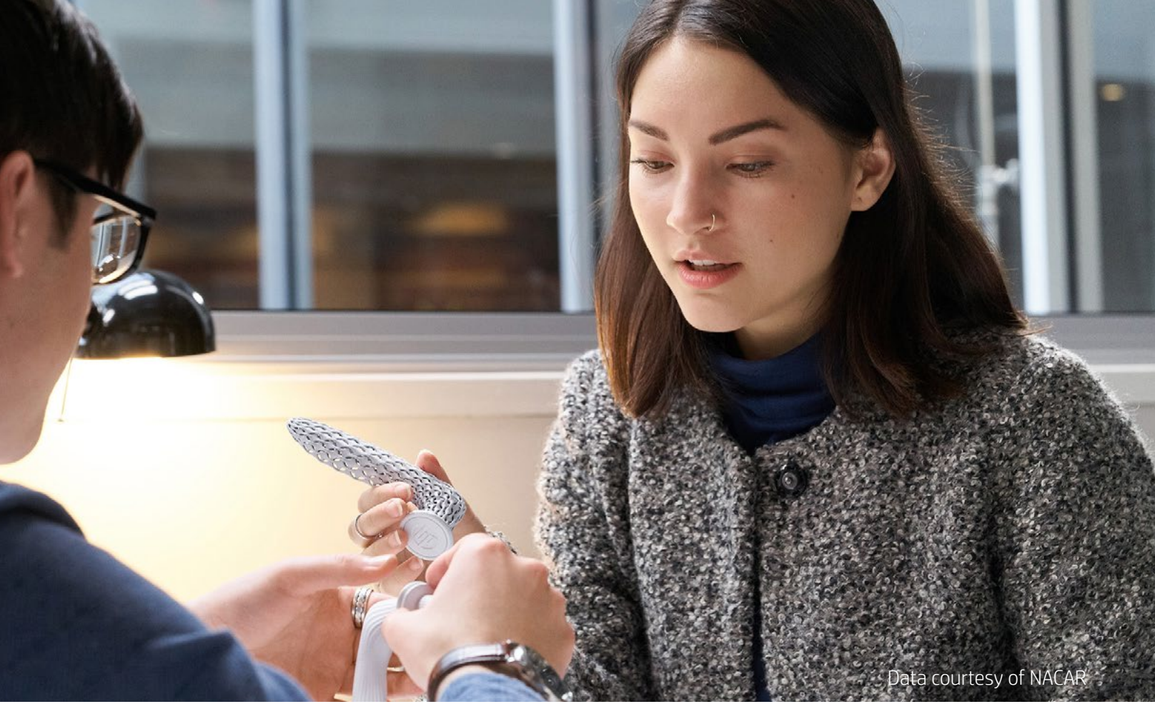
The final color of the part may vary.

Accelerate your creation workflow—produce functional parts in a fraction of the time<sup>1</sup>